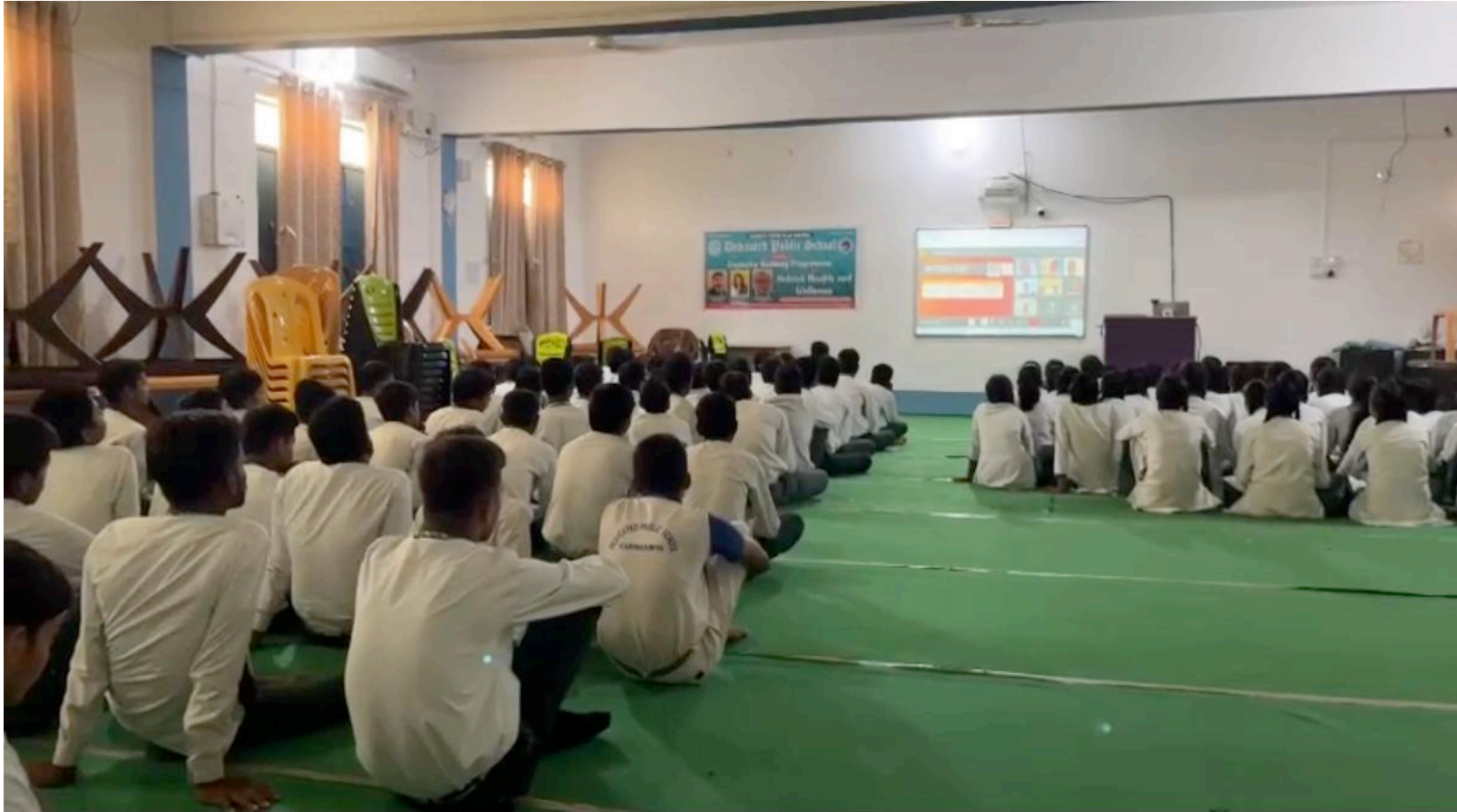
Even the schools in far-flung villages attended the Career Counselling session: students of Dedicated Public School, Karwandiya village (Dist Rohtas) listening attentively to the Counsellors.