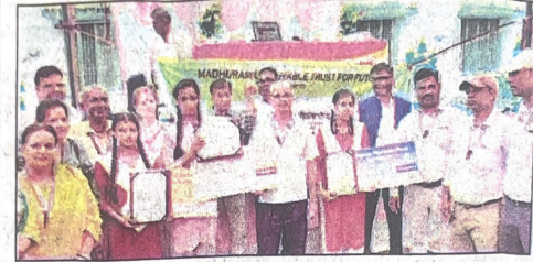
सम्मान समारोह में चेक के साथ संस्था के पदाधिकारी व अन्य।

सासाराम, हिन्दुस्तान प्रतियोगिता। 10वीं बोर्ड परीक्षा में रमाजैन बालिका प्लस टू विद्यालय की तीन सर्वाधिक अंक लाने वाली छात्राओं को बुधवार को विद्यालय परिसर में आयोजित कार्यक्रम के दौरान मधुरम चैरिटेबल फॉर फ्यूचर द्वारा सम्मानित किया गया।