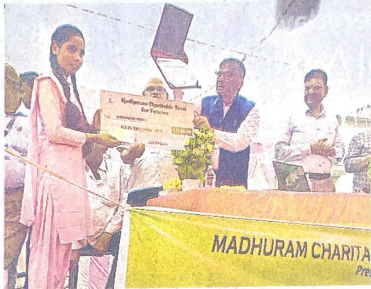
छात्रा को पुरस्कृत करते अतिथि

जागरण संवाददाता, सासाराम : स्थानीय रमा जैन बालिका उमावि गांधी पथ में गुरुवार को सम्मान कार्यक्रम आयोजित किया गया, जिसमें मैट्रिक परीक्षा 2024 में प्रथम, द्वितीय व तृतीय श्रेणी से उत्तीर्ण छात्रों को सम्मानित किया गया।